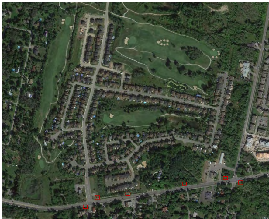
Community Location: Chemin d’Aylmer et Rue Vanier, Aylmer Sector)

This report offers three (3) locally focused solutions for even greater use of public transportation currently provided by the Société de transport de l'Outaouais (S.T.O.)